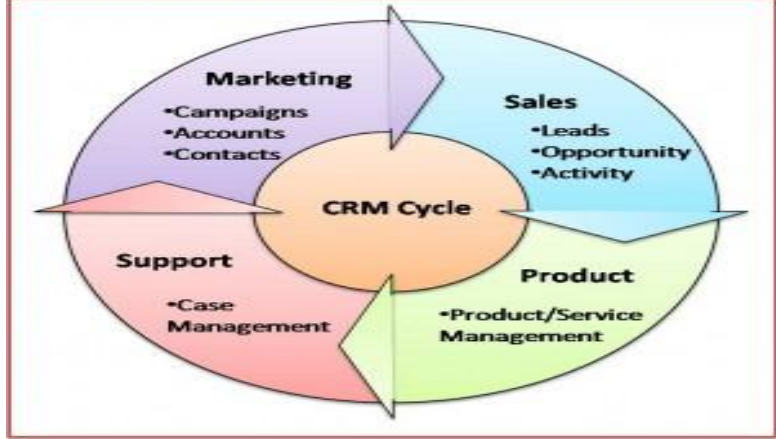
Figure. 2: Cycle of CRM

As cited in earlier sections, CRM is one of the most practical areas of DM. In general, DM has been entered in all fields of CRM, particularly in customer retention field. This point of the CRM is considered as central module of CRM cycle and has great significance. Customer happiness which refers to the difference among the customer's present condition and his hopes are considered as a necessary requirement for customer retention. Customer's faithfulness programs, which are located in this phase as one of the major components, include efforts and supportive activities with the objective of retention the long term associations with customers. Customers perform mechanical analysis; quality of services (QOSs) and customer satisfaction are considered as customer loyalty programs [5]. According to investigations, almost all DM tools have been used in CRM area.