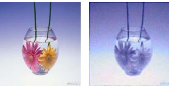
a) Original Secret Image b) Decrypted secret image Fig. 2 Original and decrypted secret image

From the fig. 2 it is clear that the final decrypted image quality is very much similar to the original secret image. The result analysis has been made by applying this system on various images of different size. The image quality has been measured by considering different image quality analysis parameters as Mean Square Error (MSE), Peak signal to Noise Ratio (PSNR), Structural Content (SC), Maximum difference (MD) and Normalized Absolute Error (NAE). The values of these parameters for different size images are shown in Table 1.