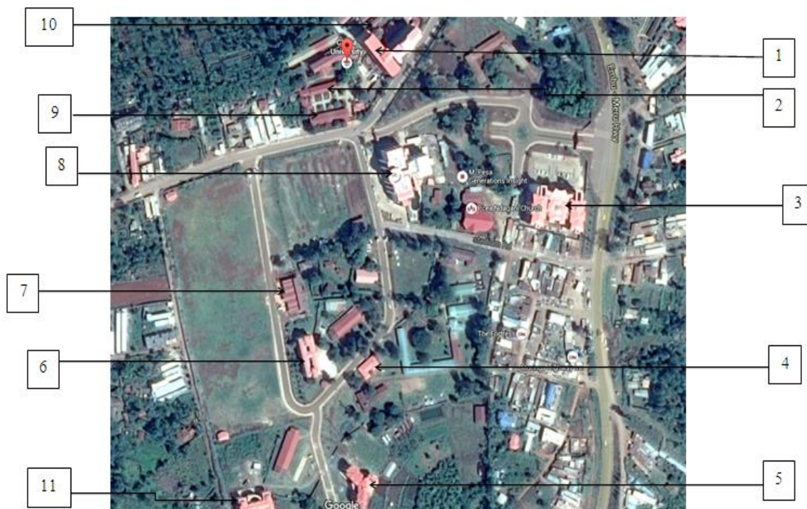
Fig. 2 aerial map of Chuka University, main campus with main buildings visible.

The building under consideration as follows: ICT center, Library, Science Tuition block, Finance, Students and Business recreation center, University Pavilion, Dispensary, Media studio, Business complex, Ladies hostels, Model school, men's hostels amongst other upcoming buildings.