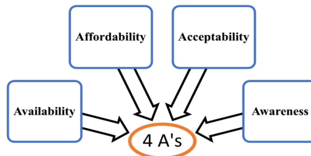
Figure 2. Four A's

The approach of spreading awareness in rural areas is different from urban. To make rural people aware about the product, the marketers need to use innovative, cost effective and simple ways to reach the customers.